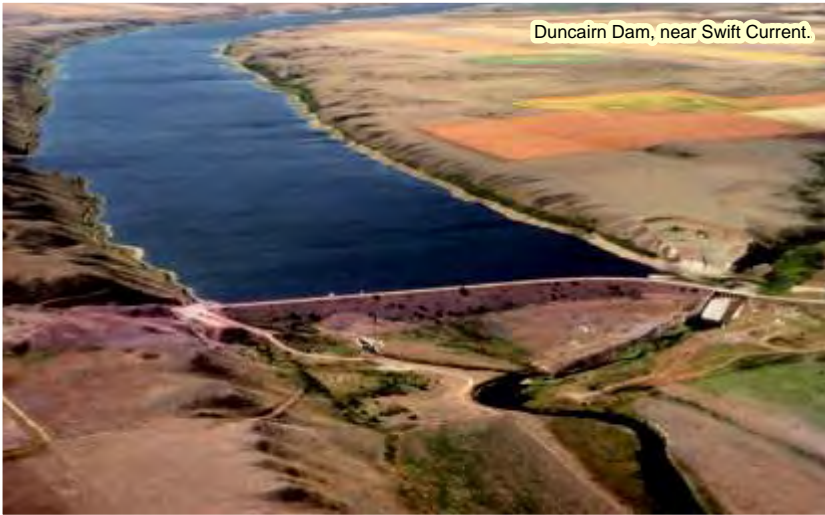
Duncairn Dam, near Swift Current.

Prairie Farm Rehabilitation Administration