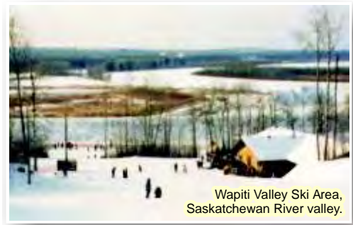
Wapiti Valley Ski Area, Saskatchewan River valley.