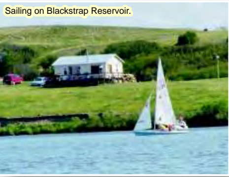
Sailing on Blackstrap Reservoir.