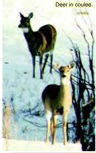
Deer in coulee.

Prairie Farm Rehabilitation Administration