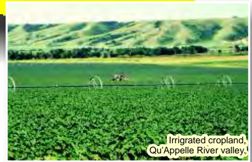
Irrigated cropland, Qu'Appelle River valley.

Large valleys, such as the Qu'Appelle and Souris river valleys, are major landscape features of vital importance to southern Saskatchewan. These valleys provide for diverse uses — water storage, farmland, wetland habitat, woodlands, gravel pits, and even ski areas. Try to imagine Saskatchewan without its valleys!