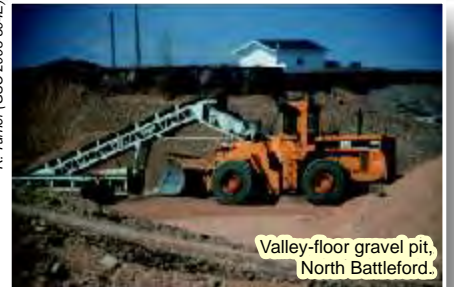
Valley-floor gravel pit, North Battleford.