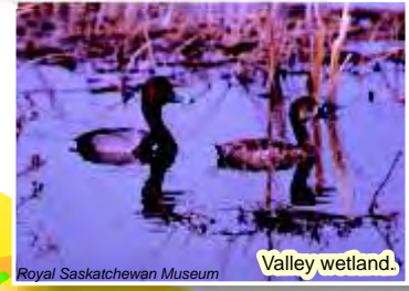
Royal Saskatchewan Museum Valley wetland.