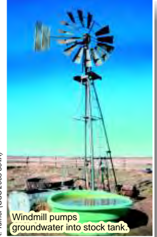
R. Turner (GSC 2003-504A)