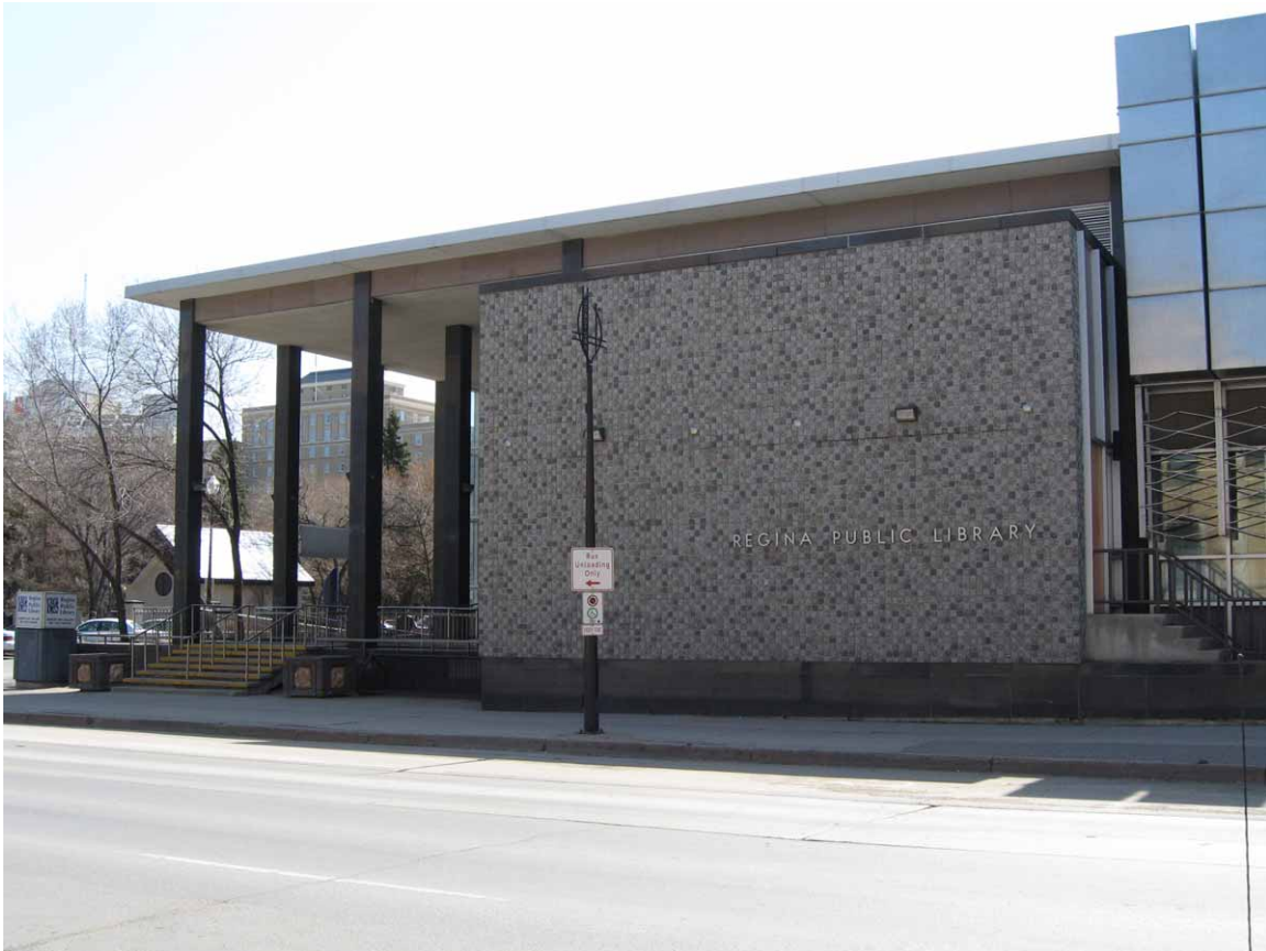
North side of Regina Central Library