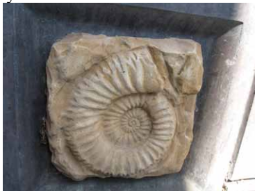
Flower tub – Ammonite