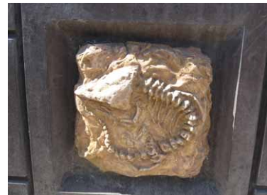
Flower tub – Ichthyosaur