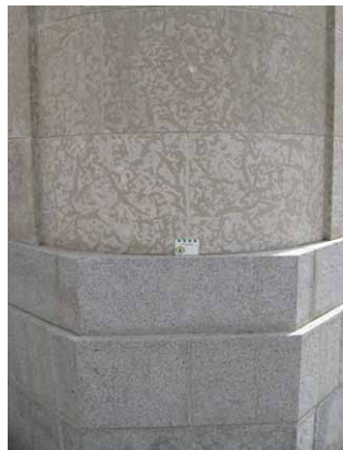
Grey granite baseboard