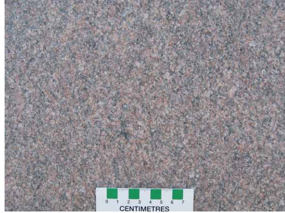
Field stone cobbles: rocks from the Canadian Shield Pink granite facing stone