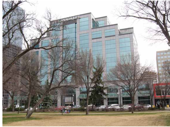
The Crown Life Building