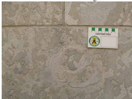
Typical Tyndall Stone containing fossil coral