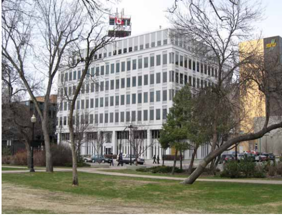
The Bank of Canada Building