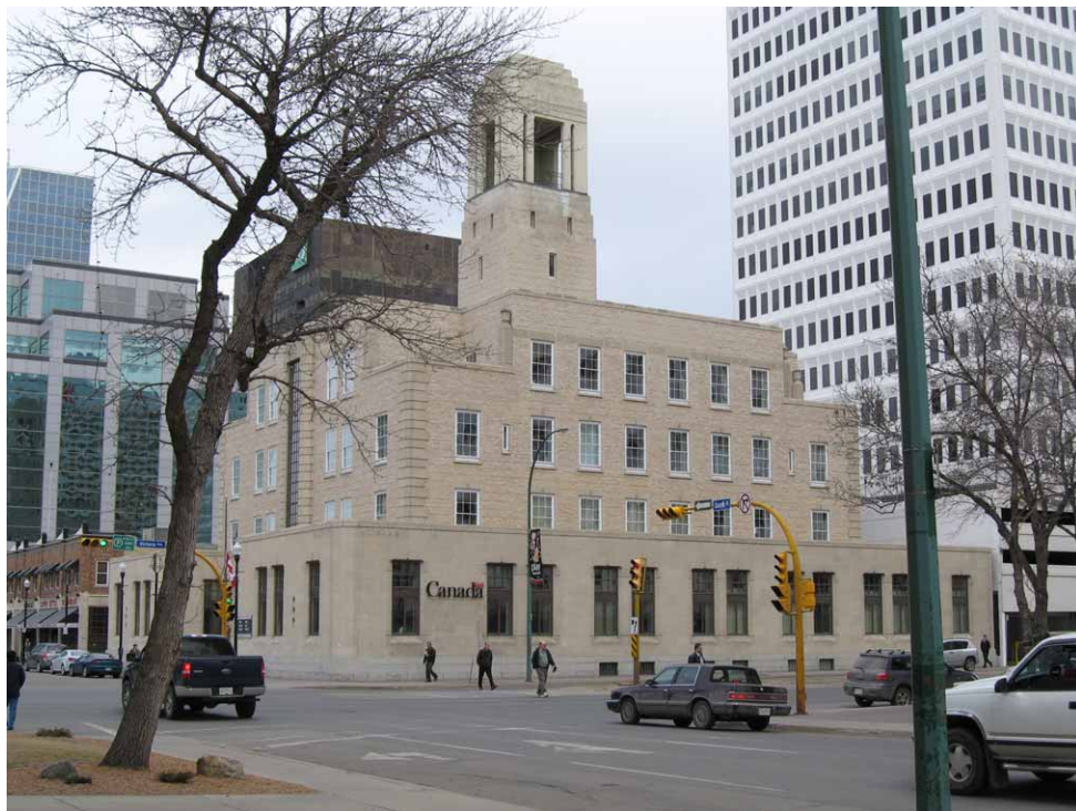
The Dominion Building Features of the stonework in the Dominion Building