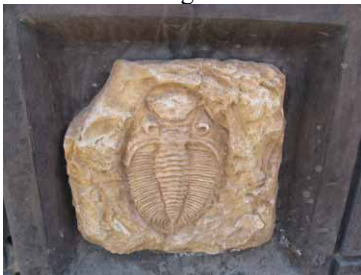
Flower tub – Trilobite